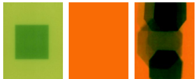
flatness and symmetry