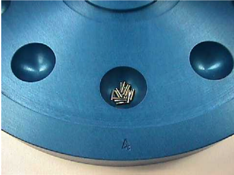
Seeds in Seed Sterilization and Sorting Tray ready for sterilization