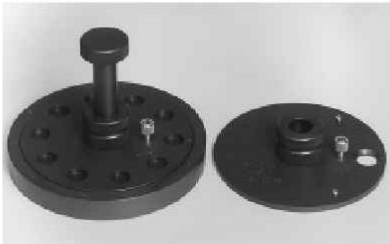
Sterilization Cover in place, Loading Cover is to the right.